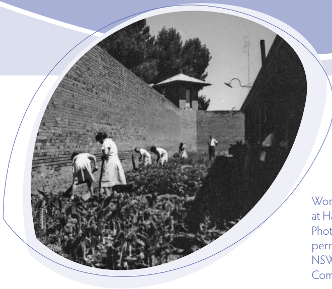
Working in the garden at Hay detention centre.